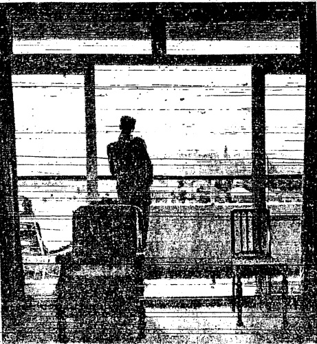
GLASS WALL, 20ft. long, divides the living room from the balcony. The glass is hung with full-length curtains of gold satin. The balcony runs the full length of the living room, but arches to the main bedroom, and a brick end wall to separate it from the next unit.

The main bedroom, which opens on to the balcony, has a suite of cedar with bedspread of Italian damask. The second bedroom has a maple suite, and both have a full wall of built-in cupboards.